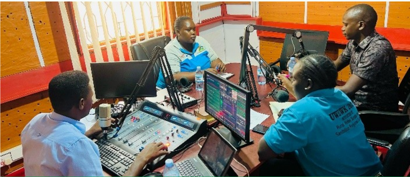
A radio talk show on Ateker FM share information regarding UWEWK 2025

The Karamoja Water and Environment Week (KRWEWK) 2025, held from March 10th to 15th in Moroto and Amudat Districts, was part of the broader Uganda Water and Environment Week (UWEWK) 2025, an annual initiative led by the Ministry of Water and Environment (MWE) through the Water Resources Institute (WRI). This event served as a platform for advocacy, knowledge exchange, and multi-stakeholder engagement to advance sustainable water and environmental management. With the theme “Water and Environment for Peace and a Sustainable Future,” KRWEWK 2025 emphasized the crucial role of Integrated Water Resources Management (IWRM) and Water, Sanitation, and Hygiene (WASH) in fostering peace and regional development. Various stakeholders, including government bodies, civil society organizations, development partners, and the private sector, actively participated in discussions and practical interventions aimed at addressing pressing environmental and water-related challenges in the region. KRWEWK 2025 featured a series of impactful activities designed to promote awareness, collaboration, and infrastructure development. Notable initiatives included the cleaning of Moroto Main Market and Loro Trading Center, spearheaded by the Uganda Red Cross Society and partners, to improve sanitation and hygiene. Additionally, the MWE Karamoja Regional Office, in collaboration with key stakeholders, conducted a joint