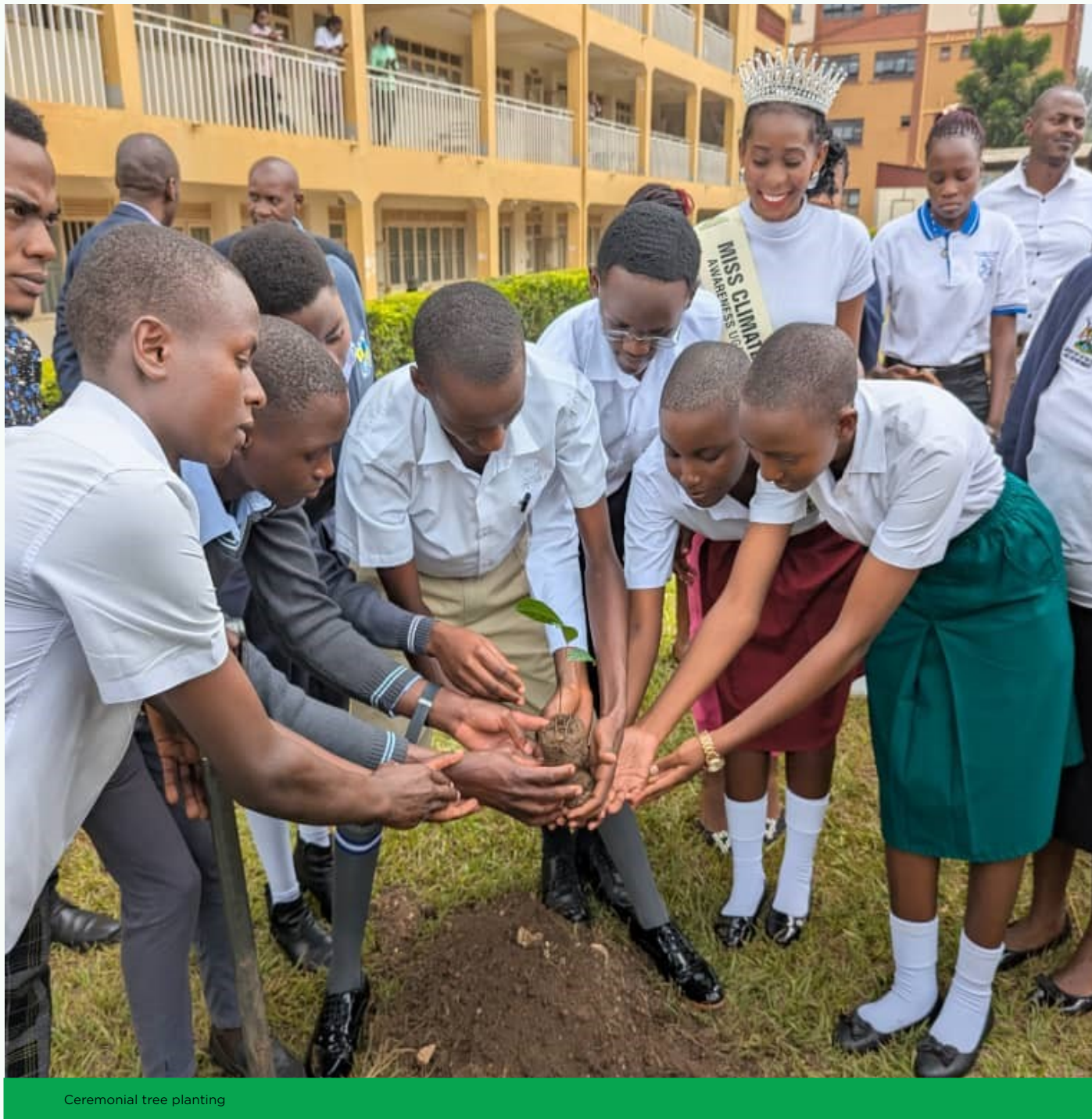
Ceremonial tree planting

urged them to persist in their advocacy for sustainable water management practices. In a demonstration of dedication to environmental sustainability, the competitions commenced with a ceremonial tree-planting event at Bishop Stuart University. This initiative underscored the event's overarching goal, serving not only as an intellectual forum for youth but also as a rallying cry for proactive measures in environmental preservation.