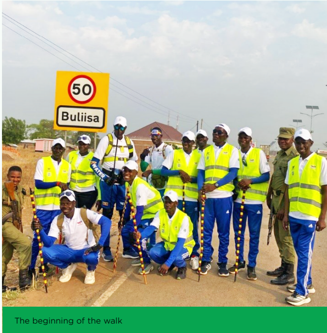
The beginning of the walk

TOTAL Energies underscored the pressing need for climate action, recognizing the severe weather challenges faced by the area. Stakeholders raised issues such as the decline of water sources, inconsistent power supply hindering water distribution, and the damage to water supply infrastructure