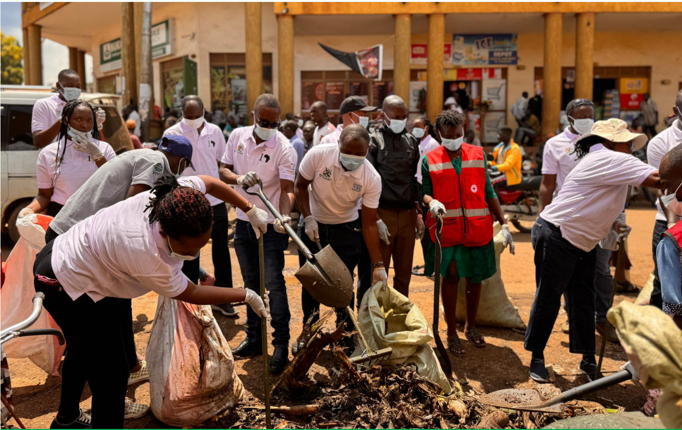
Stakeholders engage in clean exercise for Mbale Central Market

climate change. The success of past initiatives, such as the Save Mpanga River Run, underscores the impact of collective action in restoring and preserving Uganda’s vital water sources. The Ministry and its partners hope to replicate and build upon these efforts to ensure that River Manafwa and other threatened rivers across the country receive the protection they urgently need.