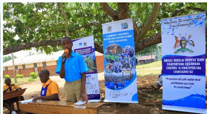
Students showcasing through Music, Dance & Drama and environmental conservation debates