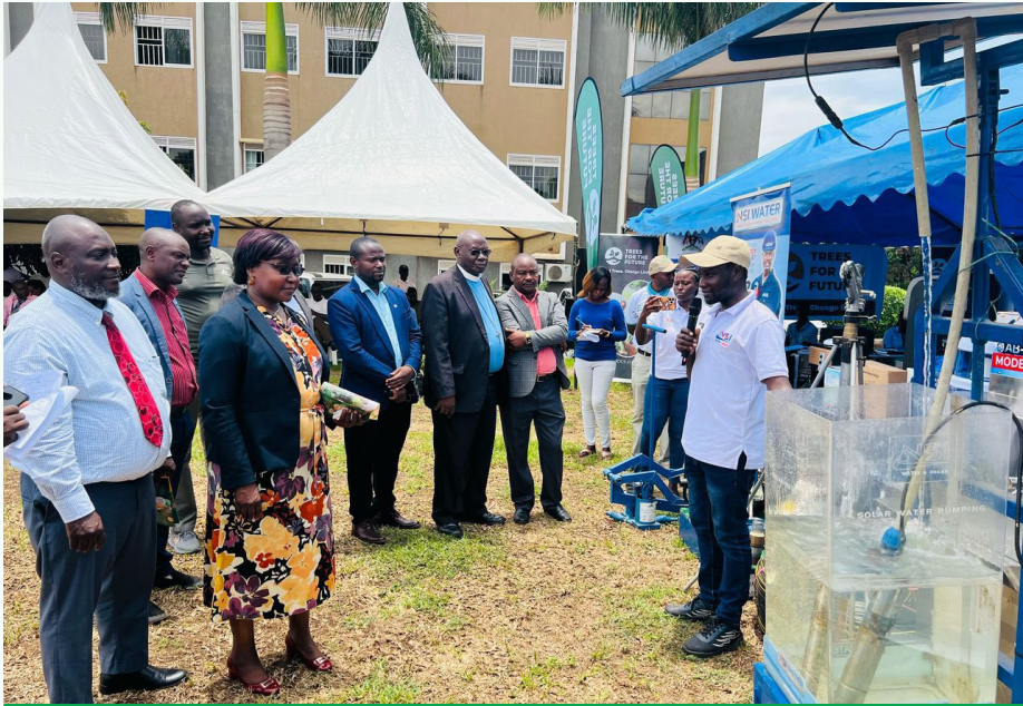
Open-day exhibitions in Mbale

The Ministry of Water and Environment, in collaboration with stakeholders, conducted a series of pre-UWEWK25 activities in the Eastern Region. These included open-day exhibitions and a clean-up exercise at Mbale Central Market, among other initiatives aimed at promoting environmental sustainability.