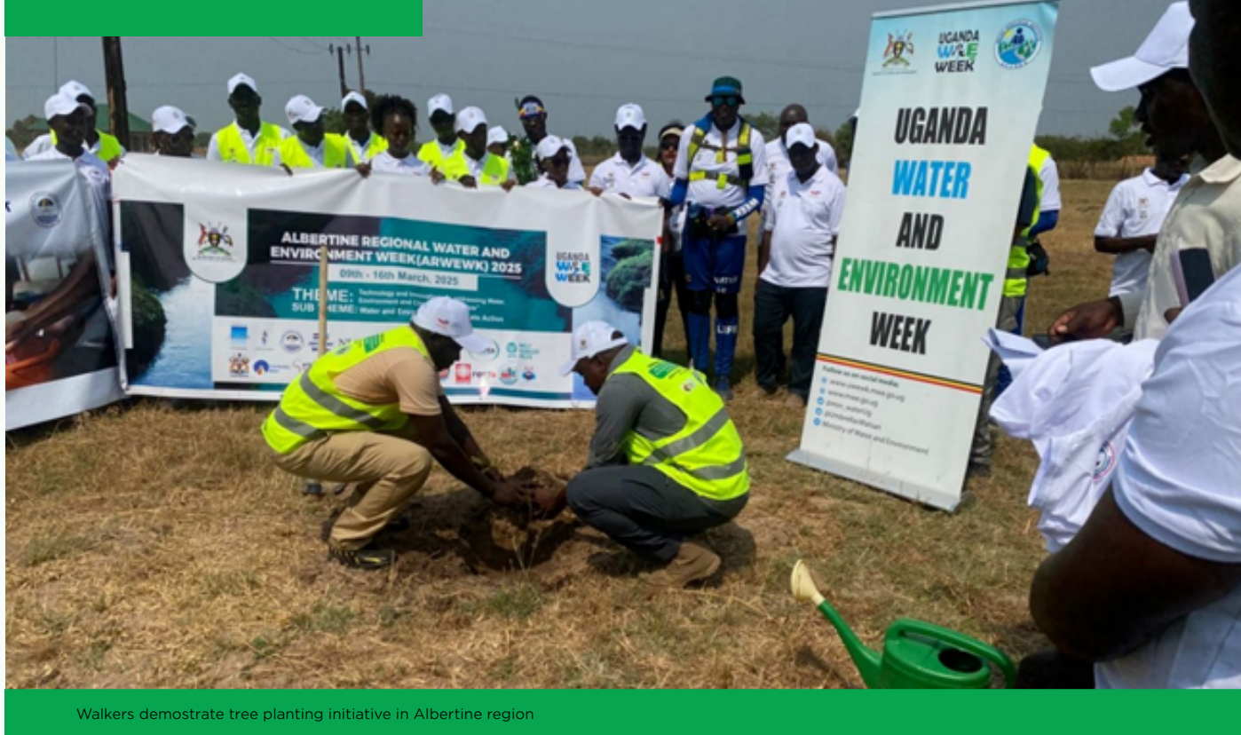
Walkers demonstrate tree planting initiative in Albertine region

alongside the congregation before being sent off to their next location.