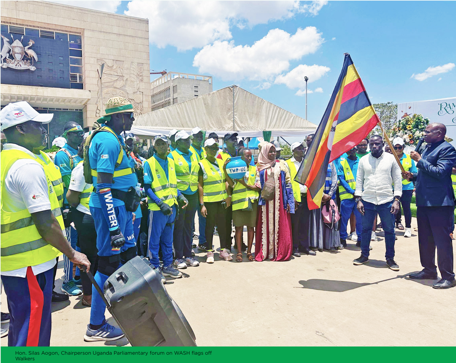
Hon. Silas Aogon, Chairperson Uganda Parliamentary forum on WASH flags off Walkers

caused by flooding. Suggested measures included the expansion of solar-powered water systems, improvements to sewage treatment facilities, and educating communities on the advantages of piped water compared to lake water. The group then embarked on a 50 km journey to Biiso, engaging in community discussions throughout the route. In Butiaba Town Council, conversations focused on the consequences of increasing water levels in Lake Albert, which have led to ongoing flooding, displacing residents, and harming water infrastructure. The lack of sufficient toilet facilities which they say has heightened sanitation concerns, while economic challenges were also attributed to the inconsistent water supply. Stakeholders suggested expanding piped water services to lessen dependence on unsafe lake water, building more sanitation facilities, and installing waste disposal bins in areas with high foot traffic. In Biiso Town Council, the walk prompted vigorous discussions regarding severe water shortages, especially