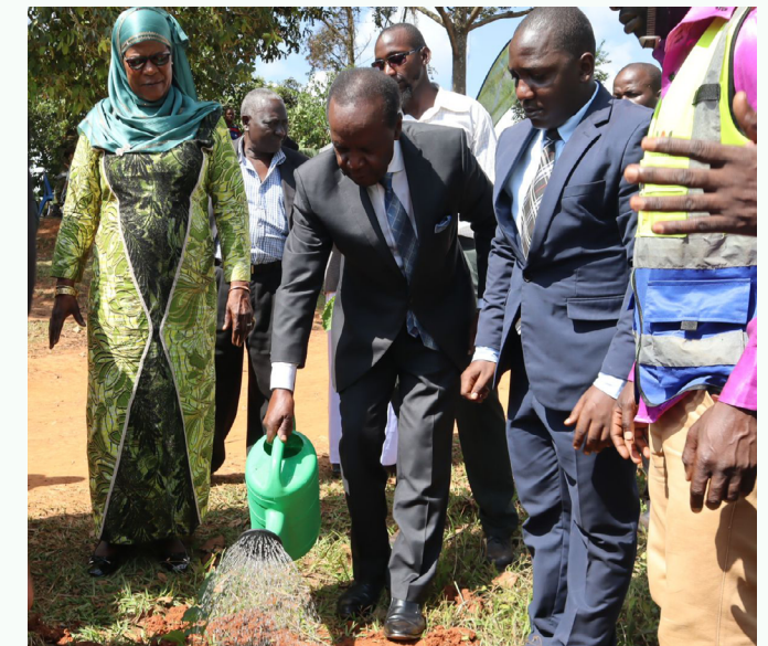
Delegates from Buganda kingdom demonstrate tree planting as a way of conserving the environment.

agencies such as the National Water and Sewerage Corporation and NGOs to expand access to clean water. Additionally, they were invited to participate in the Kabaka Birthday Run on April 6, 2025, where each participant is expected to plant 70 trees as a commitment to environmental conservation.