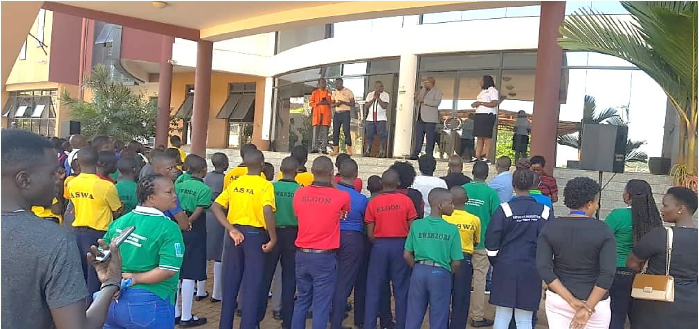
MWE launches clean up exercise in Luzira

The visibility of the Ministry of Water and Environment (MWE), Kampala Capital City Authority (KCCA), National Water and Sewerage Corporation (NWSC), Nakawa Local Government leadership, and schools in the vicinity of the market areas was notably high. Campaigns aimed at raising awareness and promoting understanding towards the protection and sustainable use of water and environmental resources, alongside the implementation of proper hygiene and sanitation practices, towards minimizing pollution risks and enhancing health and living standards were key.