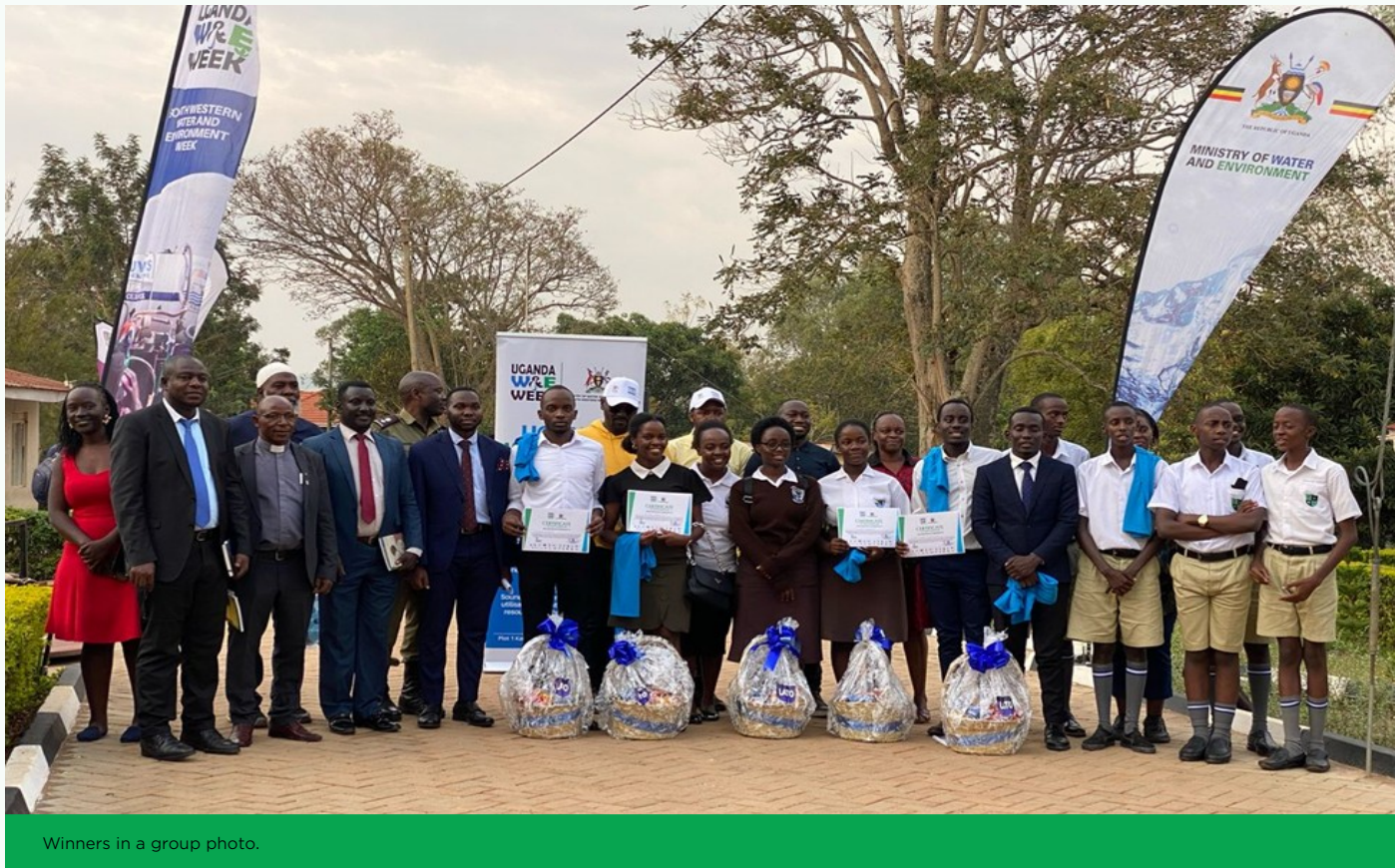
Winners in a group photo.

The Victoria Water Management Zone (VWMZ) and the Albert Water Management Zone (AWMZ), in partnership with essential stakeholders, coordinated regional Youth Debates and Public Speaking Competitions designed to promote critical dialogue on water and environmental sustainability. These events took place at Bishop Stuart University (BSU) in Mbarara in the Western part of the country, and the Rural Water and Sanitation Regional Center 5 in Fort Portal, attracting students from a range of high schools and universities. High schools included: Ntare School, Revival Girls School, Mbarara High School, Maryhill High School, Western College, Nyamitanga Secondary School,