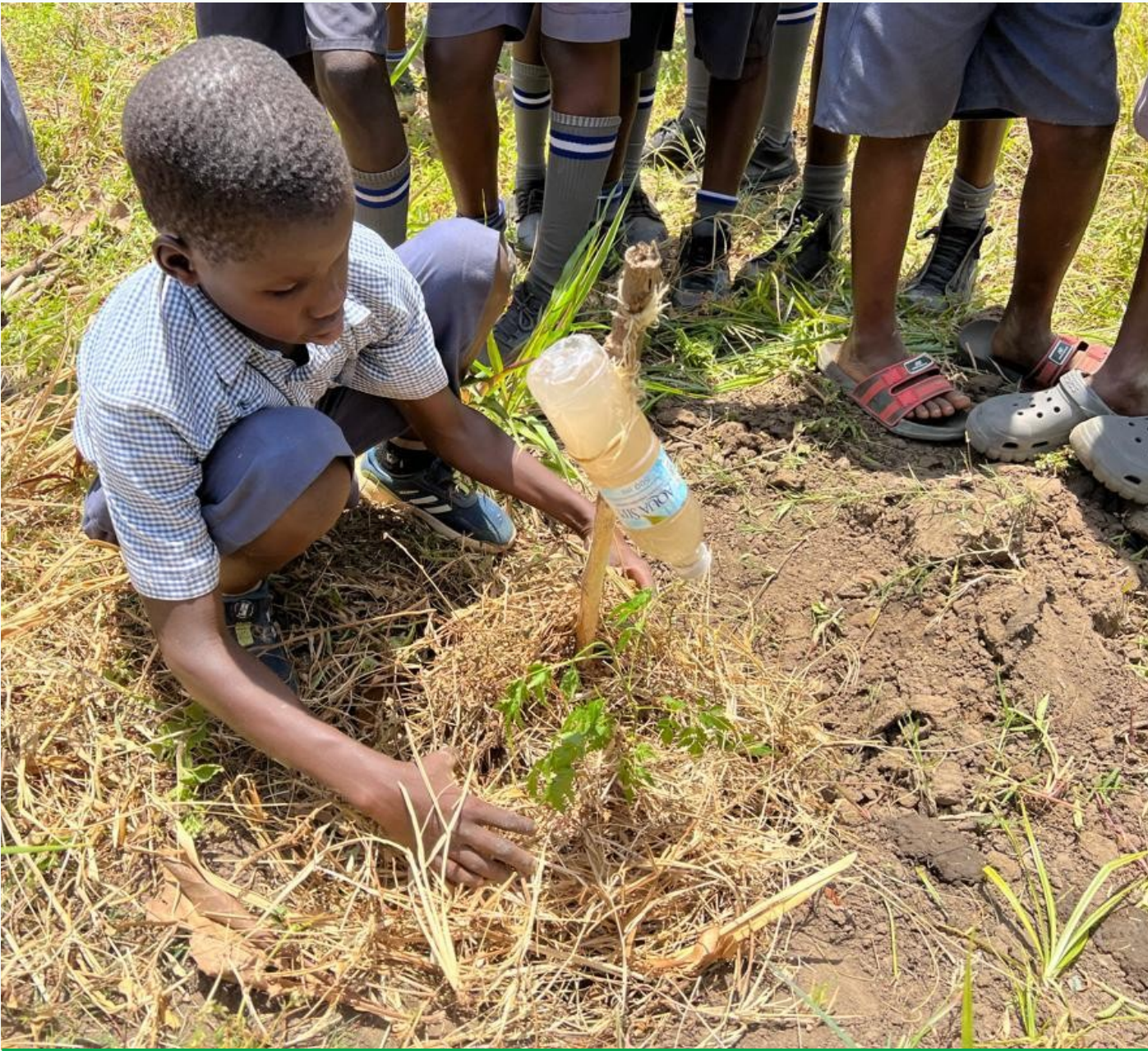
School pupils undertake tree-planting awareness in Gulu City