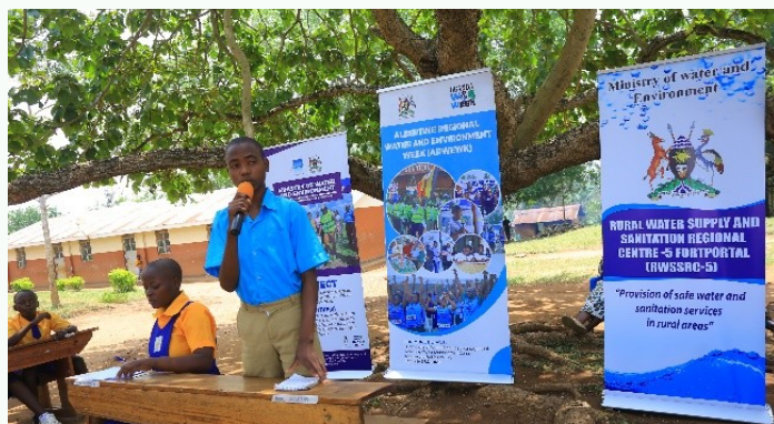
Students showcasing through Music, Dance & Drama and environmental conservation debates