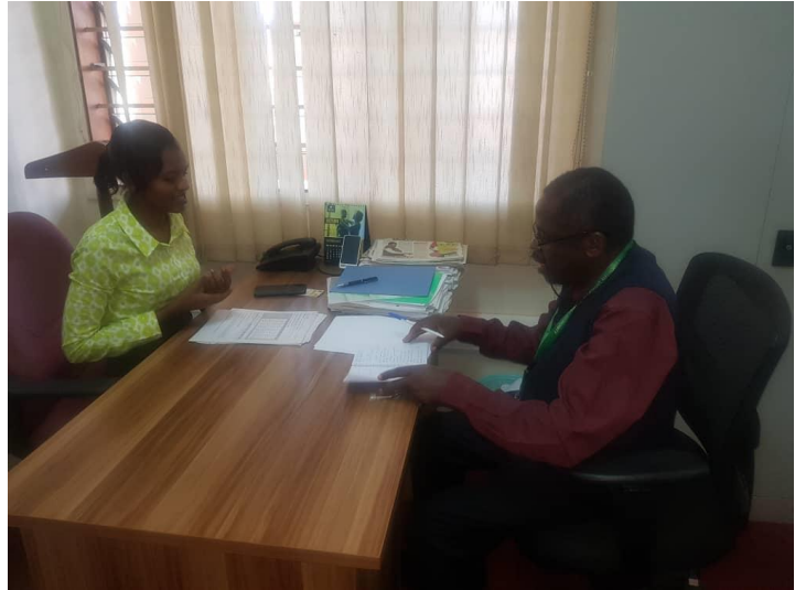
Figure 1: Consultant conducting an interview during the study